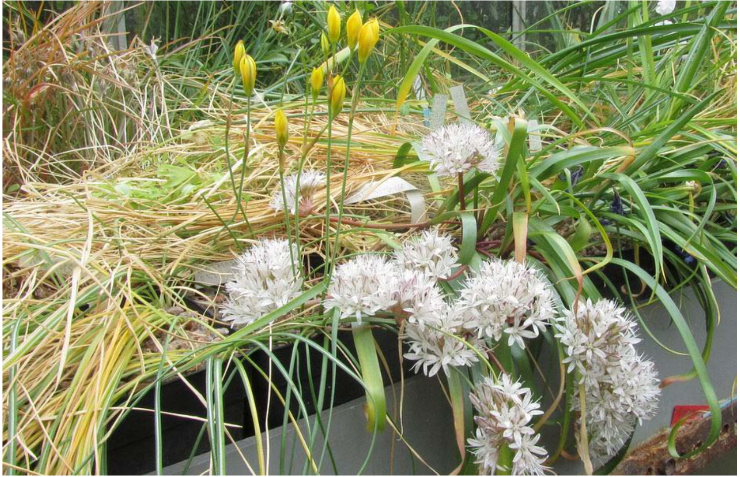
Nothoscordum ostenii and Allium yosemitense

Early dormancy is not ideal as many bulbs would have just been at the stage of adding to the food reserve in the case of true bulbs or in the case of Crocus forming a new corm when they suddenly shut down. I have a strong suspicion that when I repot I will find many crocus will have aborted at the point where the new corm is around the same size and still sitting on top of the old corm. What should happen if the growth cycle is uninterrupted is that the food reserve of the old corm is passed fully on to the new corm giving a fat new corm sitting on the shrunken remnants of the old one. Below are two of the last bulbs to flower as the others go dormant, the little yellow Nothoscordum ostenii and Allium yosemitense.