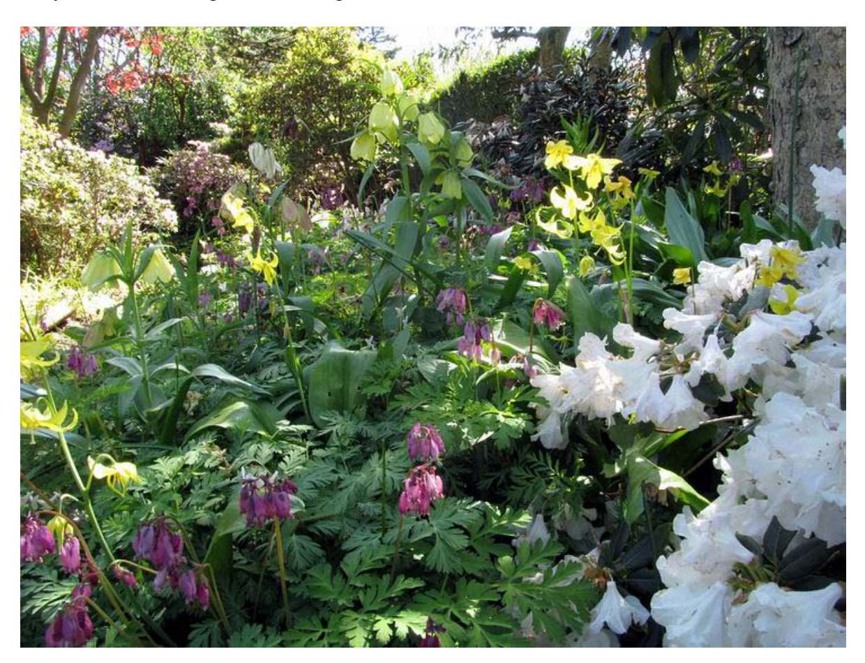
Time share planting

Dicentra hybrids, between D. eximia and D. formosa, provide a lovely foliage foil for some of the larger Fritillaria such as F. pallidiflora and meleagris to rise through. I weed out the large coarser leaved dicentra forms leaving those with finely dissected often glaucous foliage which works well with Dicentra cuccularia.