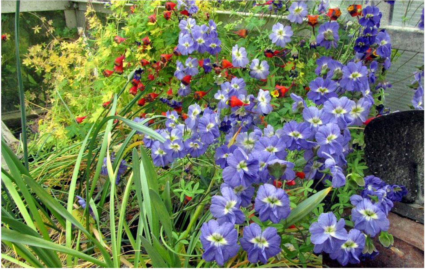
Tropaeolum tricolorum and T. azureum

If a weed is a plant that seeds around in the wrong place then here are two - Tropaeolum tricolorum and T. azureum both are self seeding around in my sand plunge. Both are very welcome as is my dandelion as long as they do not interfere adversely with the other plants that I am trying to grow.