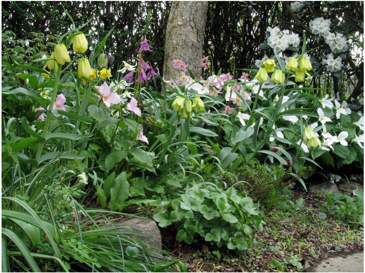
Time share planting