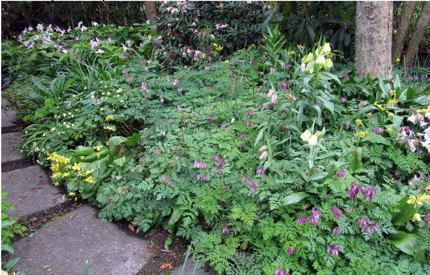
Time share planting

Many of you have shown a lot of interest in my time share plantings and how they work and look at different times so I will try and feature them more often as we move through the seasons. Sometimes it only takes a week for one group of plants to give way to another and this exceptionally hot spring has seen a very compressed flowering season. Many of the Erythroniums that in previous years would flower some weeks apart with only a short overlap have all come together this year giving us a bumper display but for a shorter period. The Corydalis solida foliage has now collapsed and many other bulbs are taking their turn.