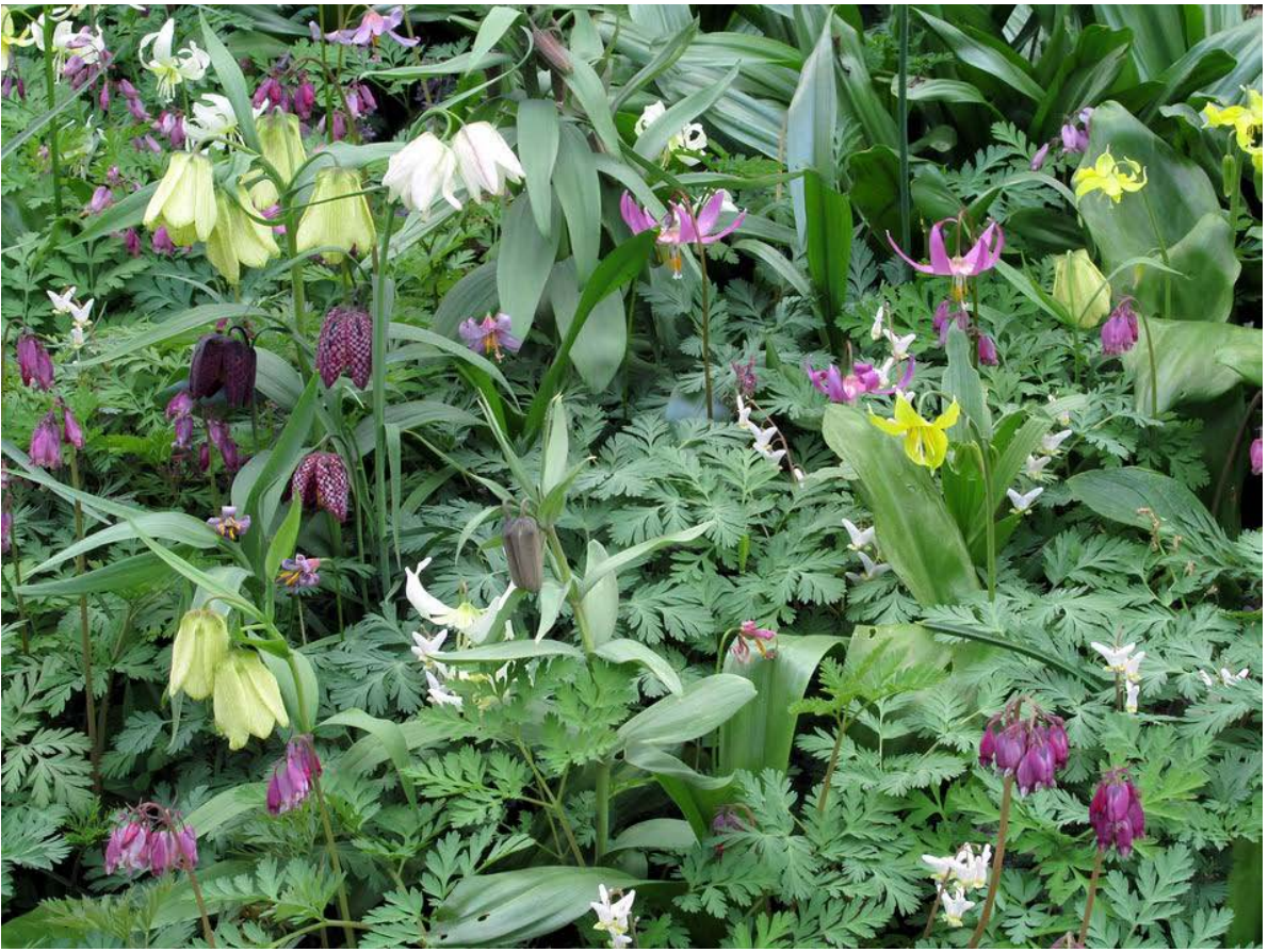
Time share planting

Dicentra hybrids, between D. eximia and D. formosa, provide a lovely foliage foil for some of the larger Fritillaria such as F. pallidiflora and meleagris to rise through. I weed out the large coarser leaved dicentra forms leaving those with finely dissected often glaucous foliage which works well with Dicentra cuccularia.